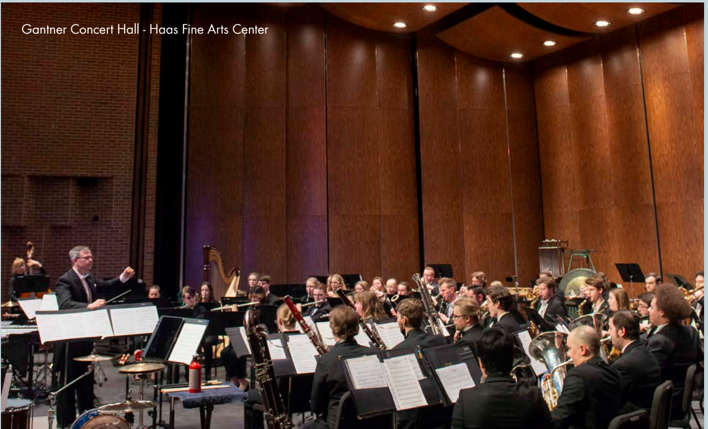
Gantner Concert Hall - Haas Fine Arts Center