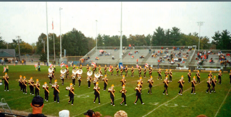
BMB at Carson Park, 2002