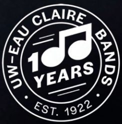
Celebrating 100 Years of Bands at UW-Eau Claire