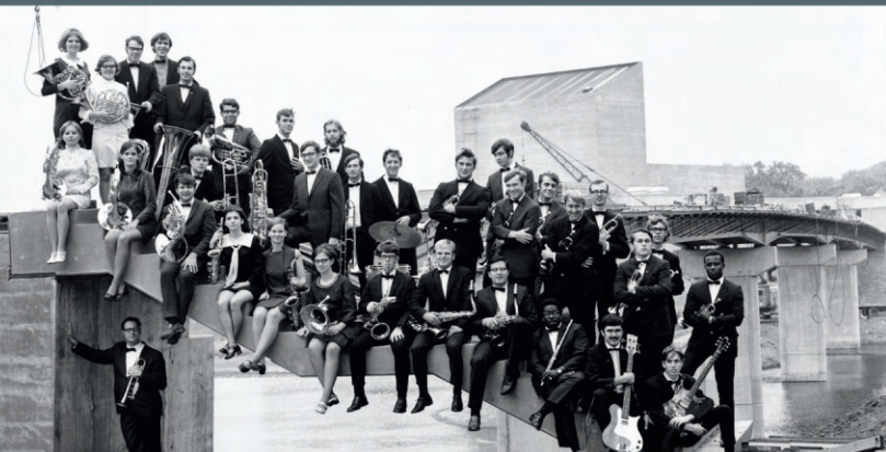
Jazz Band on unfinished footbridge, 1972