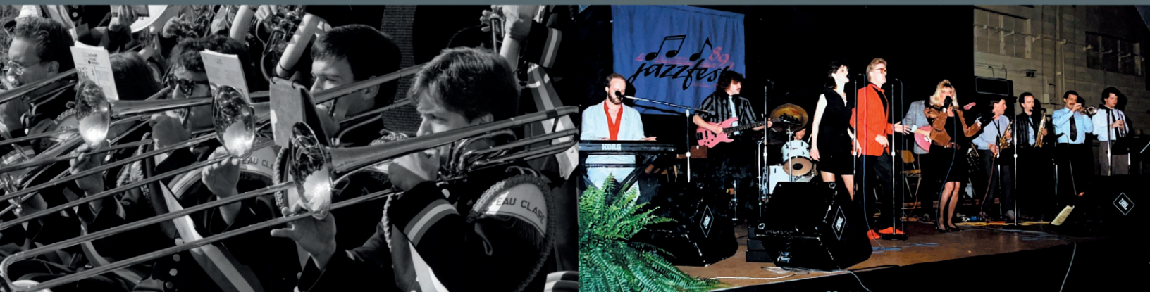
Jazz Festival, 1989