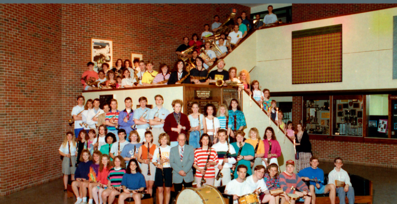
Symphony Band, 1992