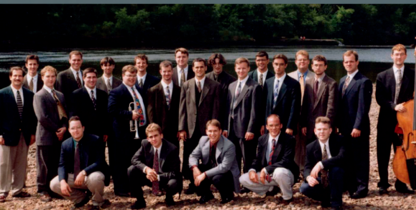
Jazz Band, 1997