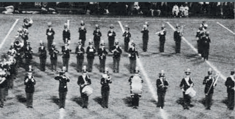
Marching Band in E formation, 1957