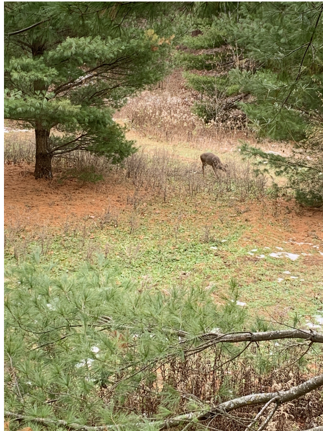
“I Spy”: November 13 th 2020

since this all started. It has been hard on everyone but it is something that we have to push through. While at the Farm my brothers and I liked to set up hunting stand and clean up the property. The picture above shows a view I took looking at the side of our hill while the sun went down. I know the picture might look like a lot but when there's only so much you can do in COVID the little things in life start to become a huge deal. After this picture was taken, I never really went back to see it because I was able to remember the beauty the picture showed. Now that I look at it, I am able to put myself back at that moment and remember what it was like to be there.