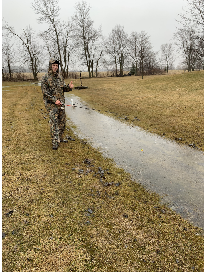
“Fishing in the Rain”: March 28 th 2020