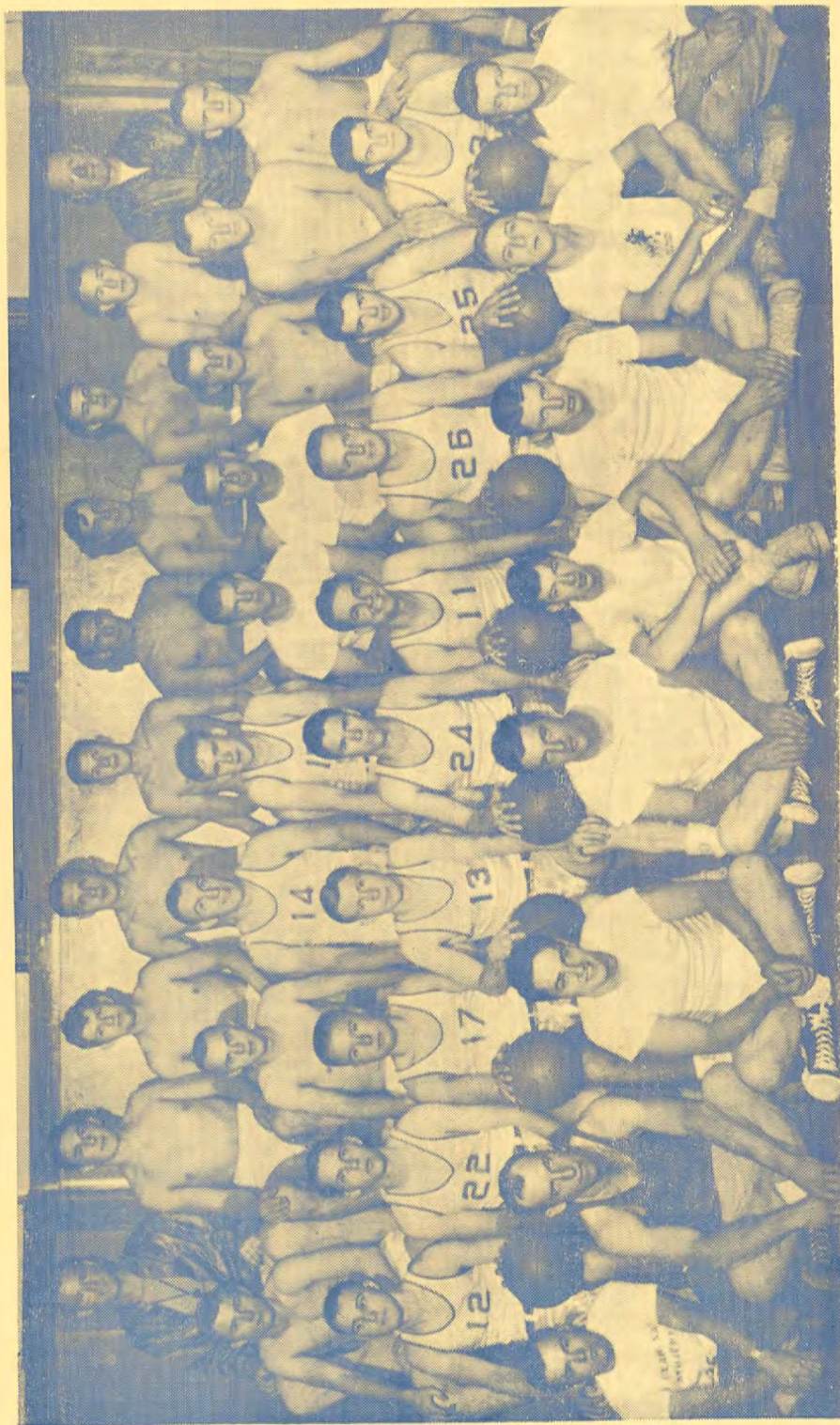
THE 1950 - 1951 BLUGOLDS